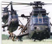
Sea King S-61

Pall Centrisep EAPS units have been protecting helicopter engines since the 1960's. More than fifty different designs have been certified and operate worldwide. They are used on a variety of rotorcraft including Agusta/Westland, Bell, Boeing, Denel, Enstrom, Eurocopter, Kaman, MIL and Sikorsky.